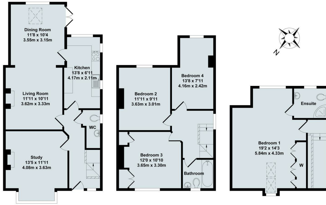
Ground Floor First Floor First Floor

Total Approx. Floor Area 1397 Sq.Ft. (129.80 Sq.M.) All items illustrated on this plan are included in the "Total Approx Floor Area"